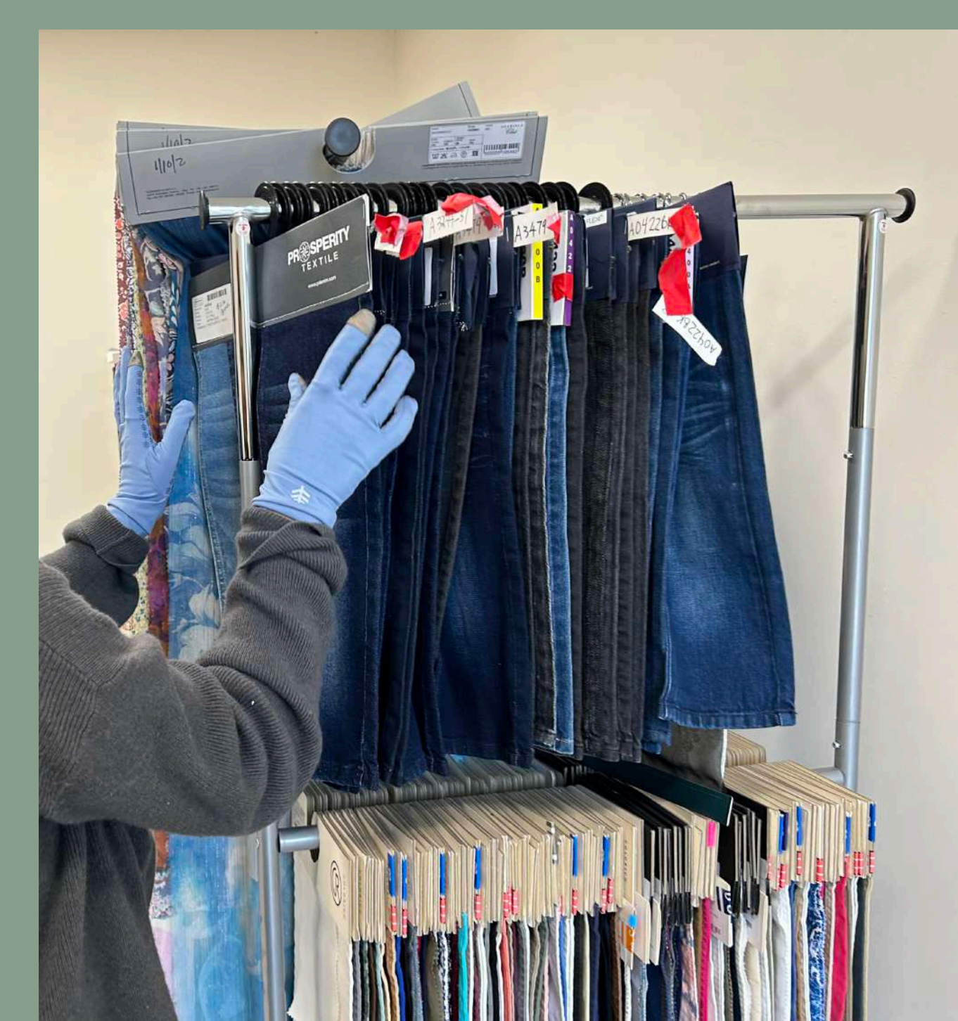
Now to be used continuously as part of Refiberd's dataset