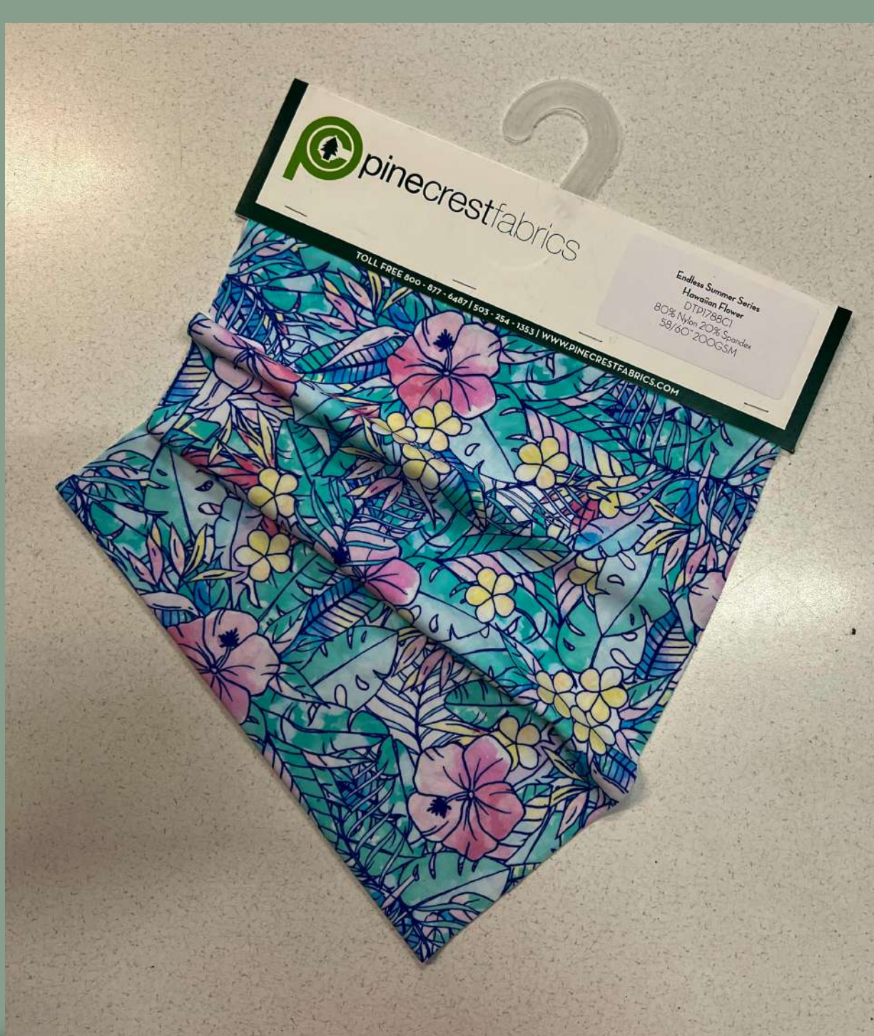
A discontinued PCF fabric

One PCF sample travels from the warehouse to Refiberd's facility, fulfilling a second life as part of Refiberd's materials library.