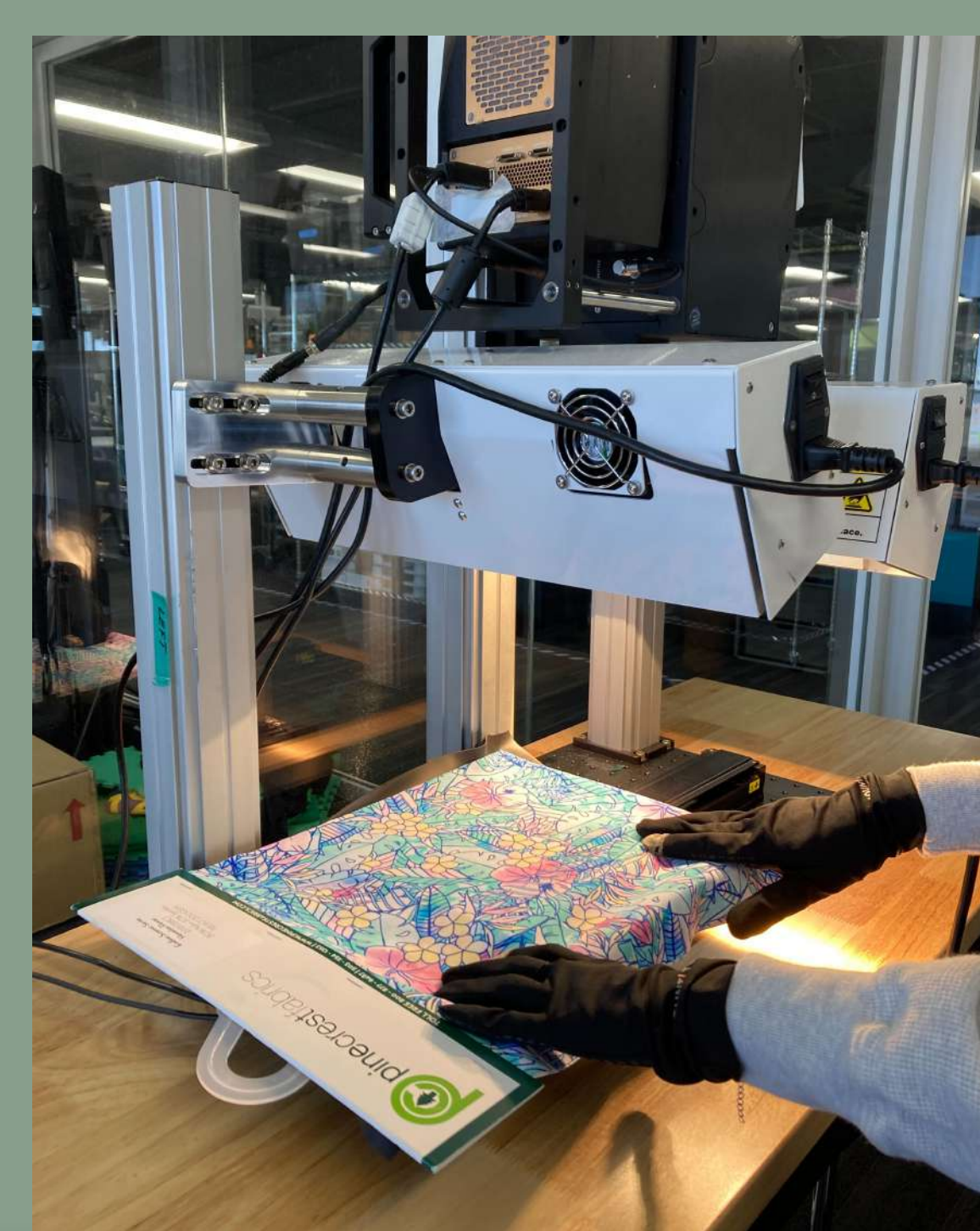
Sample is scanned + processed at Refiberd's lab