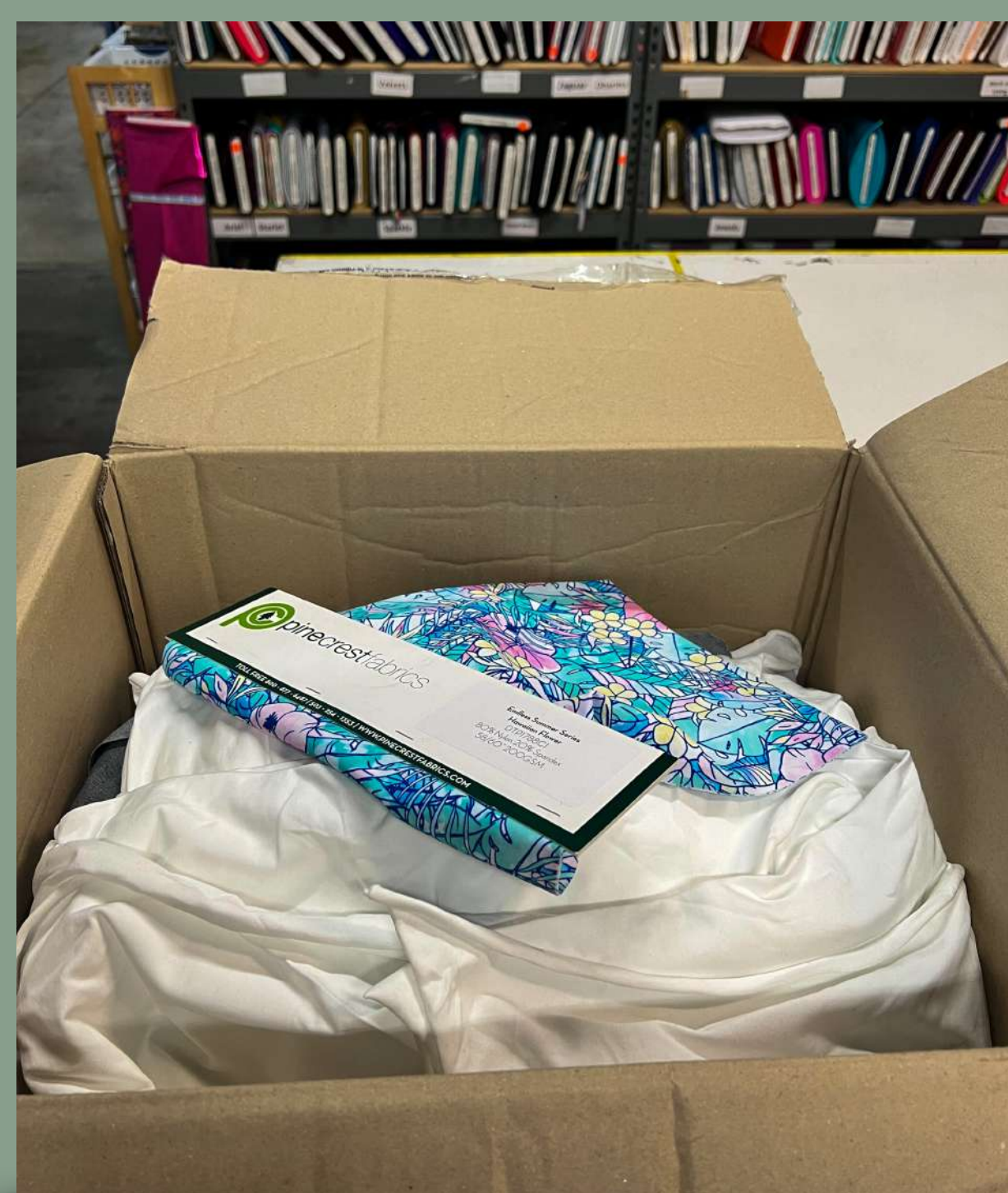
Diverted from landfill by sending to Refiberd